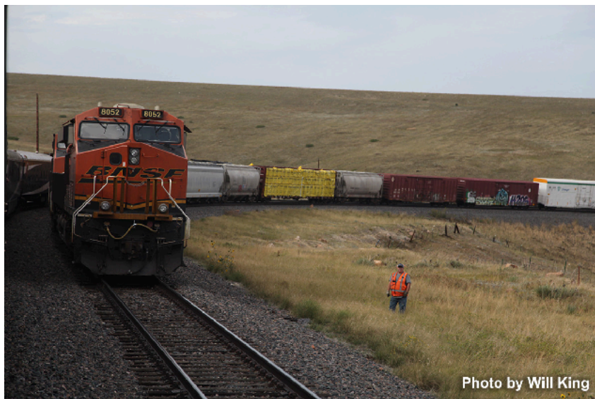
3rd Place WKNRHS Photo Contest - September 2022 - A BNSF crew member conducts a rollby inspection at the Big 10 Curve outside Denver, CO. on 9-14-22.